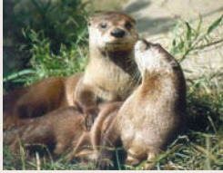
River otters clamber on logs or shore to search for a place to play. Fish is a favorite meal, but they'll also eat frogs, shellfish and mice.