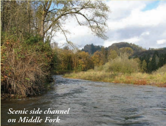
Scenic side channel on Middle Fork